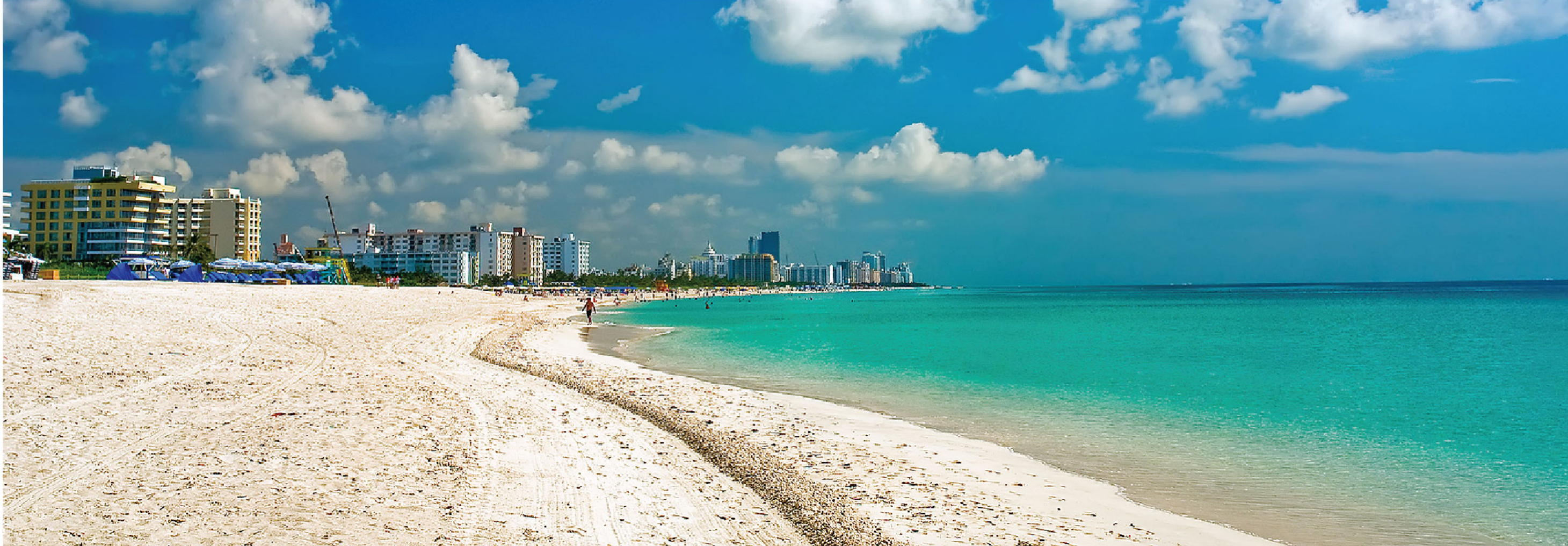
An instant icon of 21 st century architecture, Kai at Bay Harbor pierces North Miami's coast with elegance.