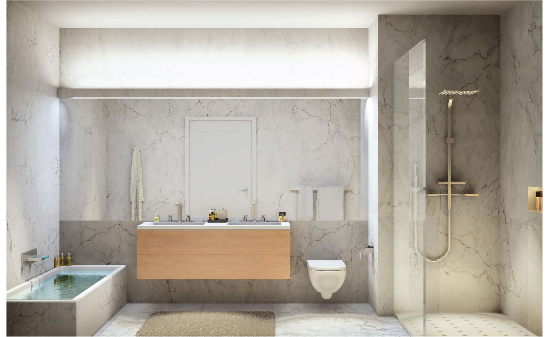
Sleek designs set a tranquil tone with marble floors and luxurious Jacuzzis.