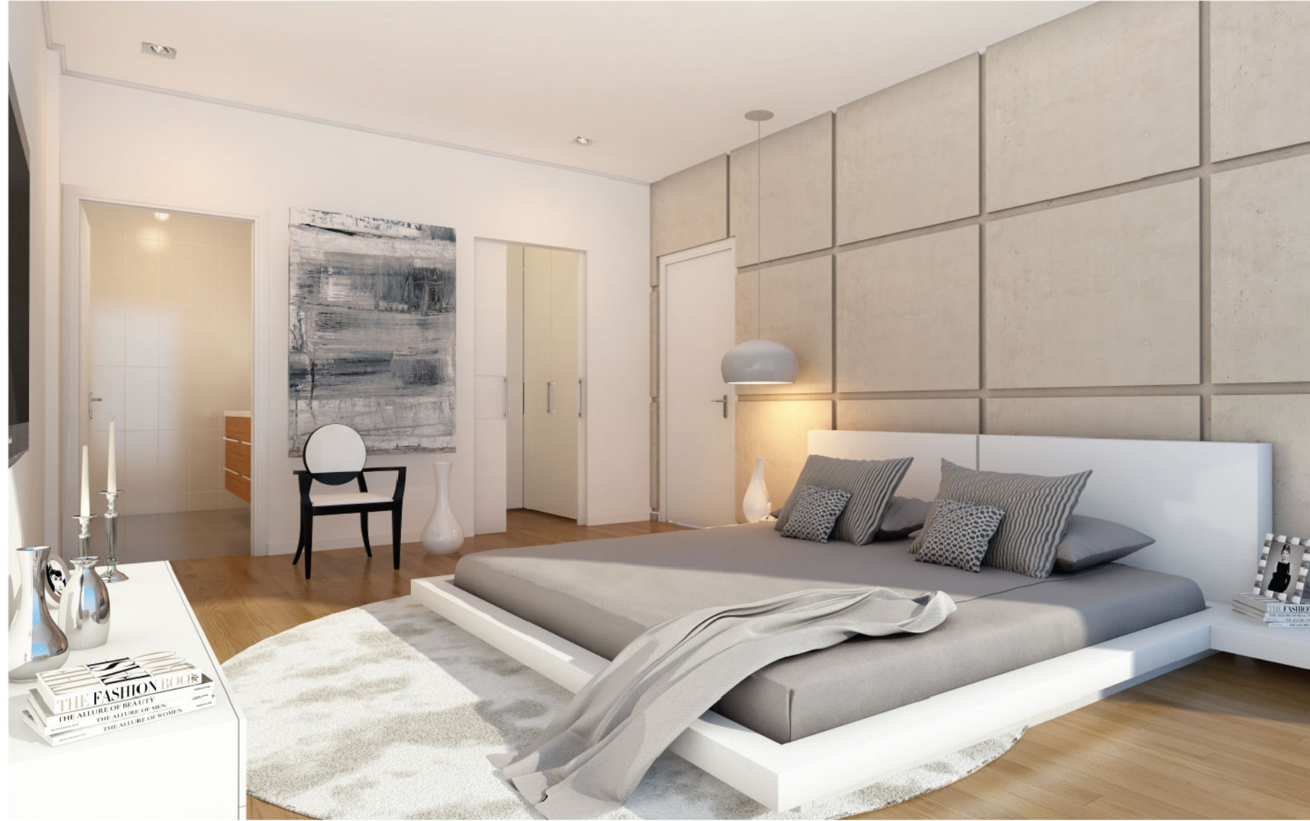
Wide, sun-filled bedrooms provide idyllic views.